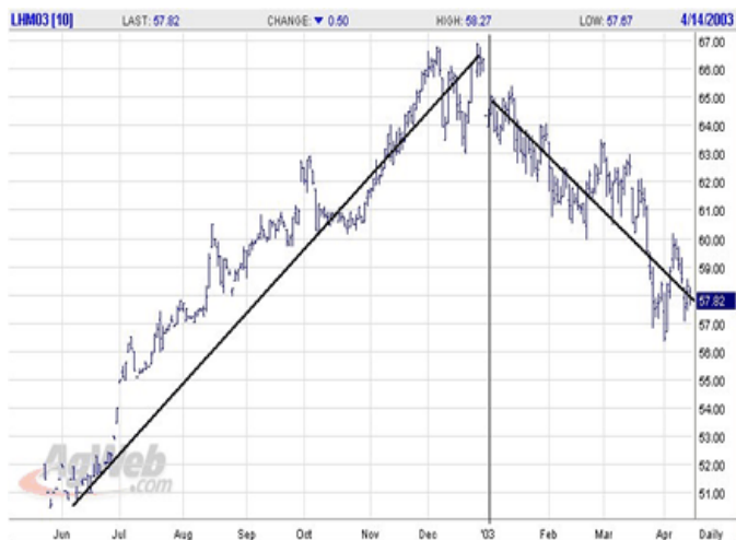
Figure 1. June '03 Lean Hog Carcass Futures Contract

Another factor that is increasingly important in this discussion is the level at which the supply of hogs is adequate to keep most packer/processor plants operating efficiently. Incremental increases in supply costs reduce the operating margin of the packer/processor, assuming all else remains equal. To make up for the loss of total dollars of profit, a packer/processor may try to increase the total volume through the plant. However, at some point it becomes better to not bid higher for hogs and optimize the supply cost and the flow through the plant, perhaps to the point of shutting down the plant.