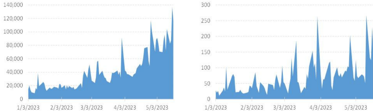
Figure 2: Daily trading volume for the corn futures contracts for December 2023 delivery – standard size (left) and mini size (right)

Will mini and micro futures contracts become more liquid for all asset classes? There is an old adage in the futures market that says that liquidity begets liquidity. Many mini and micro contracts have relatively low trading volumes because not many traders want to trade them, and not many traders want to trade them because they have low trading volumes. Normally, this cycle is broken when there is a structural change in the market, or the “new” contract fulfills a specific need. For example, the mini and micro contracts for equity indexes (such as the S&P500) gained popularity because the standard-size contract eventually became too expensive for many traders, who then started looking for more affordable instruments that allowed them to still trade equity indexes. For commodities and currencies, on the other hand, there doesn’t seem to be any similar event on the horizon that would drive traders to smaller-size contracts. Therefore, despite some advantages that they have compared to standard-size contracts, it doesn’t seem that mini and micro contracts will become extensively traded across all asset classes in the near future.